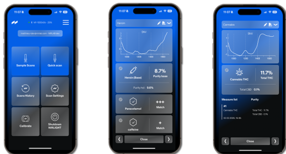
Figure 2 – NIRLAB mobile app screen, showing the results of a single scan.

equipped to detect novel substances. Additionally, these tests are qualitative rather than quantitative, offering limited information on drug potency or purity—vital data for distinguishing between personal use and trafficking offenses.