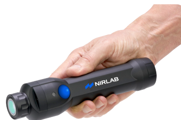
Figure 1 – Handheld, wireless spectrometer.

Law enforcement agencies worldwide confront a discouraging challenge: the rapid propagation of new and unregulated psychoactive substances. The existing arsenal of drug-checking methods, particularly colorimetric tests, is proving to be increasingly ineffective. This is mainly due to limited detection capabilities and slow processing times. This critical shortfall necessitates a technological evolution. This white paper presents NIRLAB's near-infrared (NIR) technology as a transformative tool that promises to redefine the landscape of drug analysis. With its capacity for fast, accurate, and non-destructive testing, NIRLAB is set to become an indispensable asset in law enforcement's ongoing campaign to intercept the flow of illicit drugs and ensure public safety. Here, we scrutinize the current predicaments faced by law enforcement and delineate how NIRLAB's innovative approach can not only resolve prevailing issues but also fortify agencies against the complex dynamics of drug trafficking.