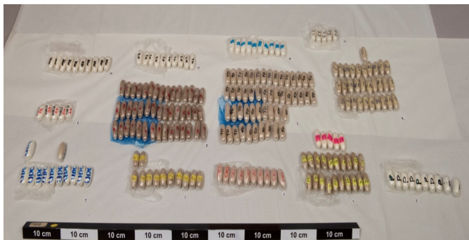
Figure 1 – Drug seizure with multiple cocaine fingers. A sampling strategy needs to be determined prior to analysis. NIRLAB can help select the relevant fingers to analyze.

One of the primary benefits of NIRLAB is its ability to quickly identify substances, allowing forensic scientists to screen large volumes of samples efficiently (Figure 1). This capability is crucial for prioritizing samples that require more detailed and time-consuming analysis. It also facilitates broader sampling strategies and helps assess homogeneity within large seizures. By quickly identifying common illicit substances, NIRLAB aids in making immediate decisions, optimizing resource allocation (More here ). Additionally, the non-destructive nature of NIR spectroscopy means samples remain intact for further testing, preserving evidence integrity.